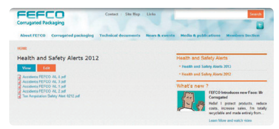
Fefco website, members only section: sharing accident details

We are constantly adapting the issues to be covered in the light of information from new accidents. This was the case with the item "confined (isolated) spaces". An accident occurred in a room where there was no second exit and where there was a sudden release of high pressure steam, resulting in the situation where a man suffered substantial burning because he could not get out of the room. Our work is never ending, and at present LTT is a major issue at association level.